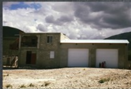
New Mechanic Shop